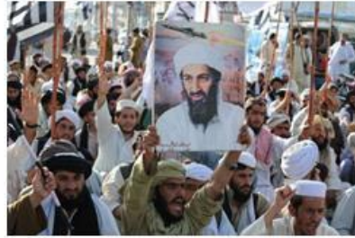
Group 3 Images