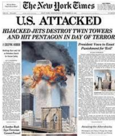
Group 1 Images