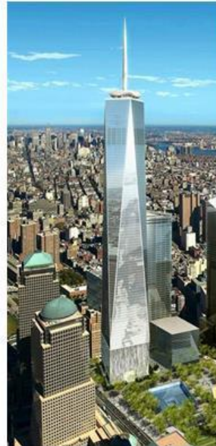
Group 2 Images